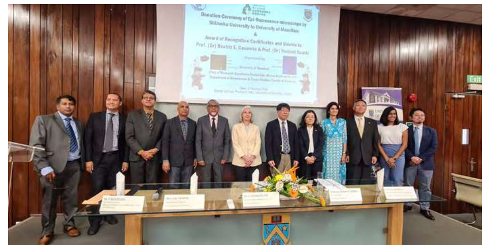
Epi-fluorescent Microscope Donation Ceremony