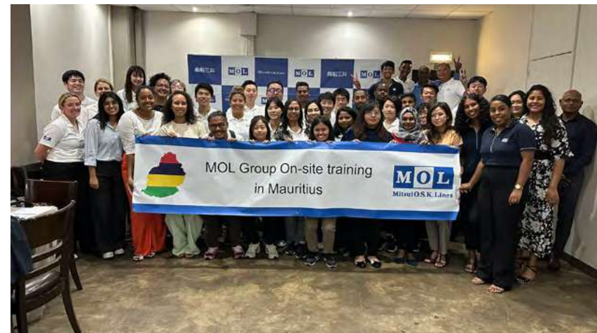
Workshop with IBL Ltd Sustainability Champions