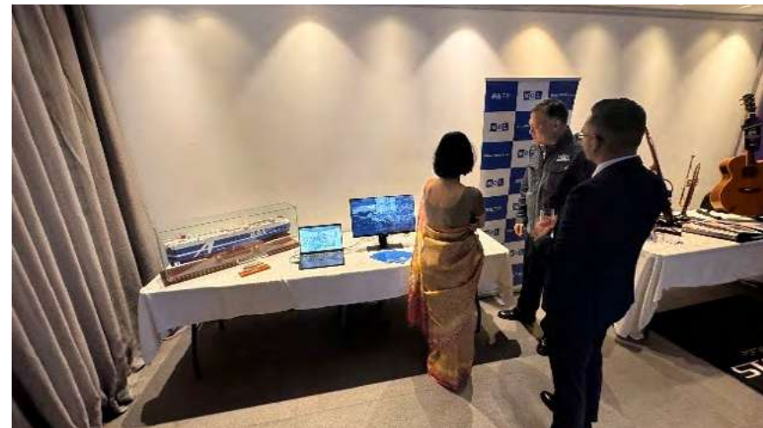
Display of scale models ships