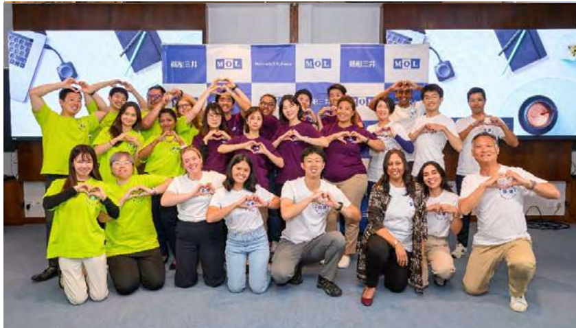
Group photos of teams

This training event represented a critical step towards adding value to sustainable practices into our operations, highlighting the MOL Group's commitment to environmental stewardship and the development of its human resources.