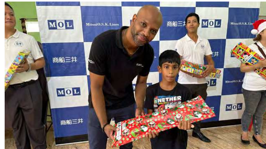
Christmas gifts distribution