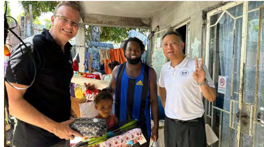
Distribution of food packs with members of Precious Plastic Mauritius