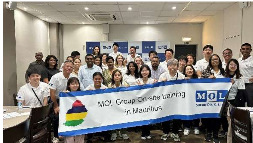
Workshop with Rogers Group Sustainability Champions