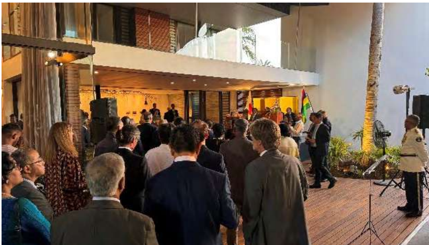
Reception at the Ambassador’s residence

On February 29, 2024, MOL (Mauritius) Ltd participated in the celebration of the 64th Birthday of His Majesty the Emperor of Japan at the ambassador’s residence in Mauritius. During this significant event, MOL (Mauritius) Ltd highlighted its activities in Mauritius and showcased scale models of three innovative ships: the FSRU ship for LNG transportation and storage, the “Beluga Ace” Car Carrier ship symbolizing MOL’s legacy of innovation and eco-friendliness, and the Wind Challenger Ship, “SHOFU MARU,” exemplifying MOL’s commitment to reducing greenhouse gas emissions through wind energy.