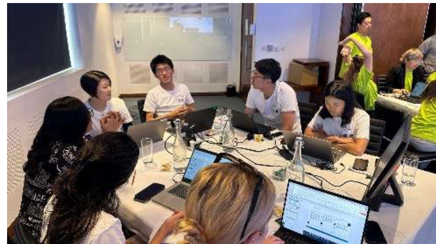
This training focused on environmental protection, conservation, human capital and strategies, aligning with MOL's five sustainability issues (Materiality)