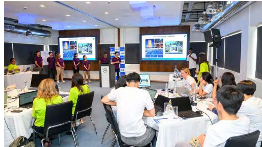
Final Group Presentation