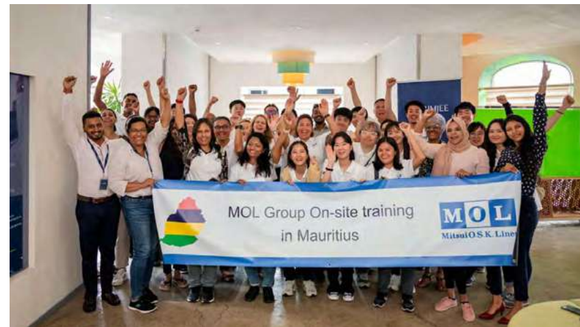
Workshop with Curimjee Jewanjee & Co Ltd Sustainability Champions