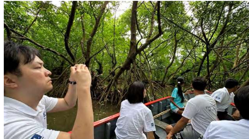
MOL (Europe Africa) Ltd strategic sustainability meeting in Mauritius with MOL (Mauritius) Ltd