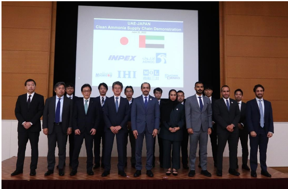
Ceremony for clean ammonia supply chain demonstration at IHI