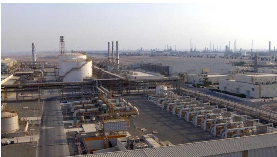
Ammonia production plant in Abu Dhabi