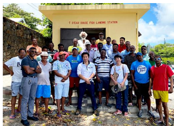
Development for use of hydrosphere resources