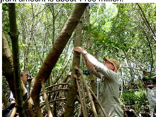
Conservation of mangrove forests

Organizations in Mauritius and research institutes and organizations in Japan applied for first-year funds for many high-quality projects. After a fair and objective evaluation by the fund steering committee, a total of 11 projects in two categories— “natural environment restoration and conservation projects” and “local community contribution projects.” The total grant amount is about ¥100 million.