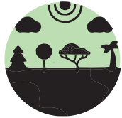
Agri-environment and biodiversity

We have divided the projects into four categories: